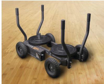
Gentle on Hardwoods