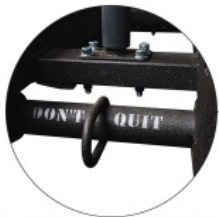
TOW HOOKS FOR PULLING AND BATTLE ROPES