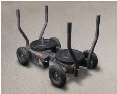
Gentle on Carpeting