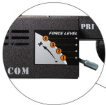
VARIABLE MAGNETIC RESISTANCE