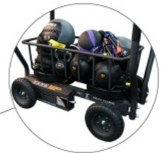
WEIGHT HORNS FOR TRACTION AND ACCESSORIES