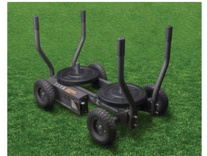
Gentle on Turfgrass