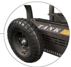
GENTLE ON ANY SURFACE