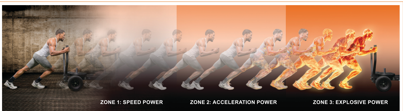
ZONE 1: SPEED POWER