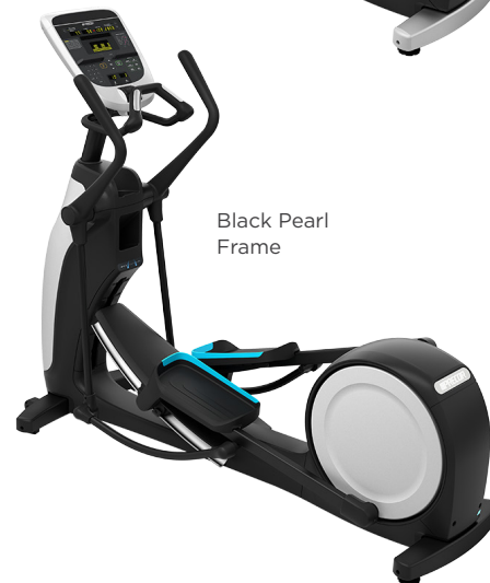
Black Pearl Frame

Refined colorways with dark Tungsten covers and two frame color options.