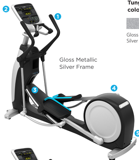
Gloss Metallic Silver Frame

Alerts staff at a glance when the EFX needs maintenance or service.