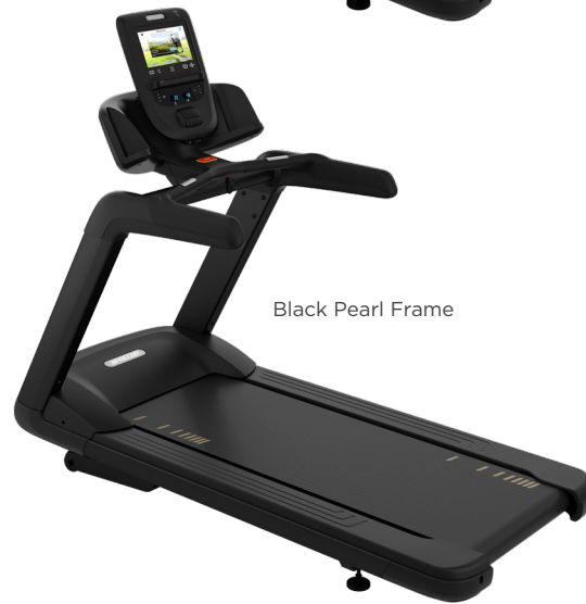
Black Pearl Frame

Refined colorways with dark Tungsten covers and two frame color options.