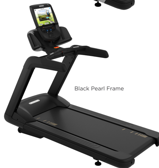
Black Pearl Frame

Refined colorways with dark Tungsten covers and two frame color options.