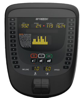
P30i Interval Console