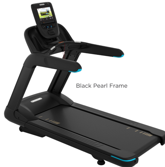
Black Pearl Frame

Refined colorways with dark Tungsten covers and two frame color options.