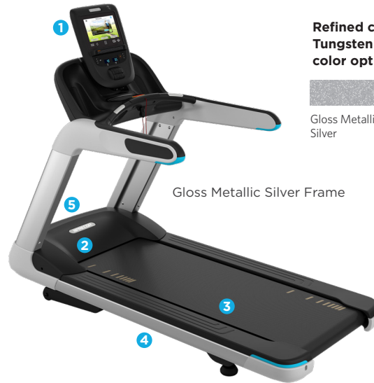
Gloss Metallic Silver Frame

To increase uptime, an external status light lets you and your staff know at a glance the operating condition of your treadmill and when to perform life-extending maintenance.